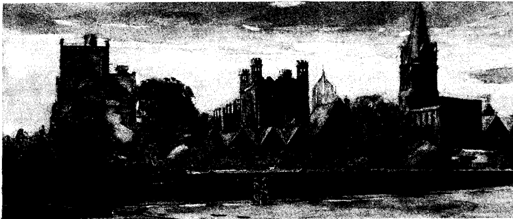
CHRIST CHURCH COLLEGE, OXFORD.

have been used to say that our great fault was a defective ability to stop work and enjoy ourselves. It has been hard for us to stop work, particularly at home. If, as somebody has computed, Americans spent a hundred millions in Europe last year, it was partly because they were ashamed to be seen enjoying themselves in their own hard-working land, or didn't know how to do it. It will not always be so. We will realize after a time that recreation is really worth providing for at home, and as that time comes nearer, the Genesee Valley Hunt Club will become in an increasing degree an interesting study as an institution of a meritorious species, and very good of its kind.